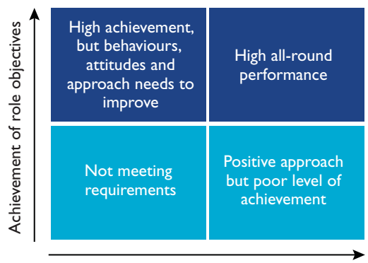
Behaviour, attitudes, overall approach to work